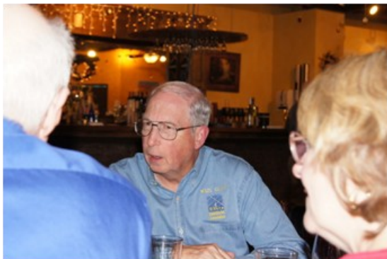
You haven't paid your dues???