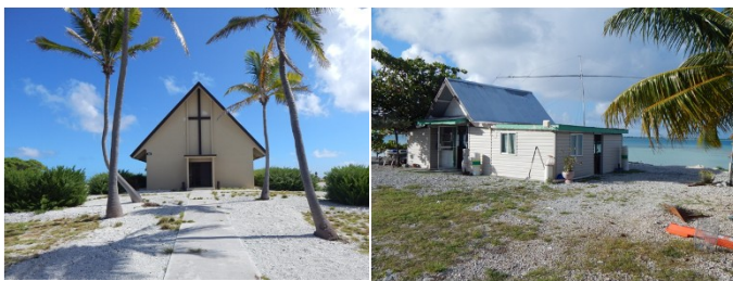
Operating Locations. The Chapel and the Beach House