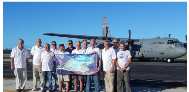
The Team with their Chariot Behind Them

Address, telephone, and email address changes should be directed to the Secretary/Treasurer at the above address or via email at: jcw53@cornell.edu .