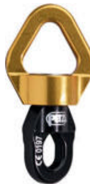
Petzl Swivel $67.00

And several people have seen and asked about a couple gadgets they've seen me use, namely, a simple swivel attached to a rope or carabiner. But it's not just an ordinary swivel—this is a Petzl ball bearing-equipped swivel that makes tramping beams or orienting a rope's direction smooth and painless. Pricy, but an energy and timesaving addition to my toolbox.