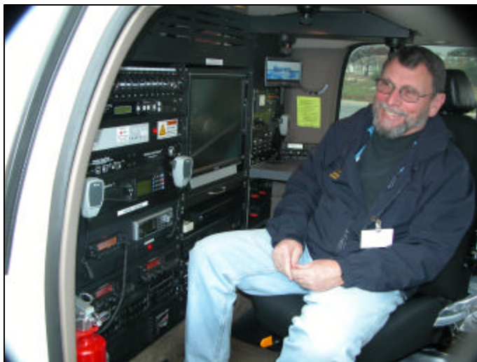
The operator's position and external antennas show this to be a well-equipped vehicle.