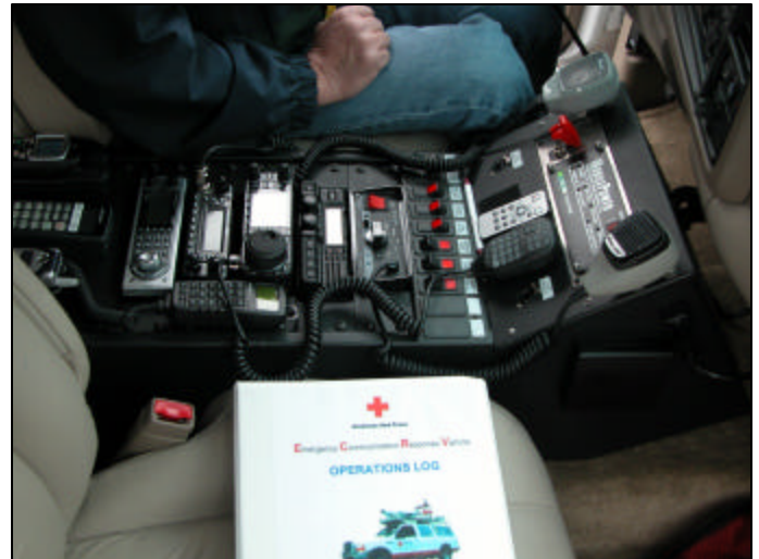
Even the driver has a well-equipped workstation. Numerous hand-helds are packed in equipment boxes stowed in the cargo space.