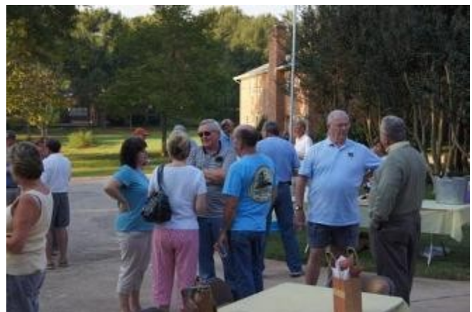
Some Pre-Dinner Face to Face QSOs