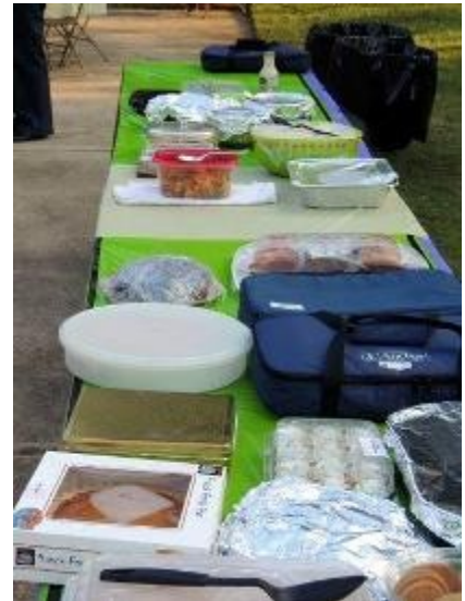
The Food Table: Pre-Dinner