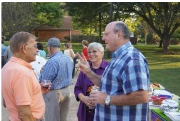
I'm sure I worked NH8S twice....