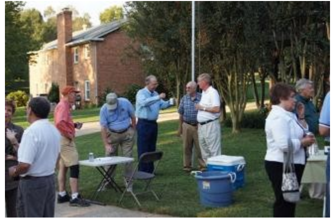
More Pre-Dinner Conversation