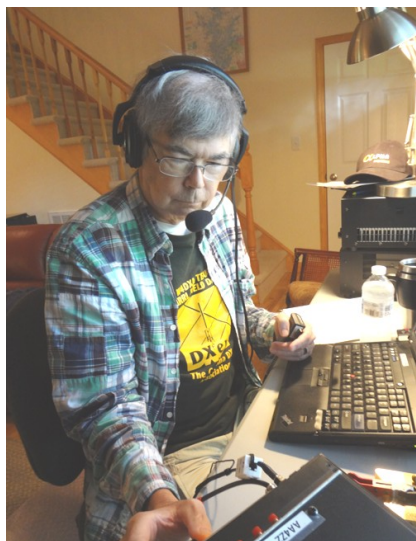
NV4A struggling to find "fresh meat" on 20 SSB Sunday morning.