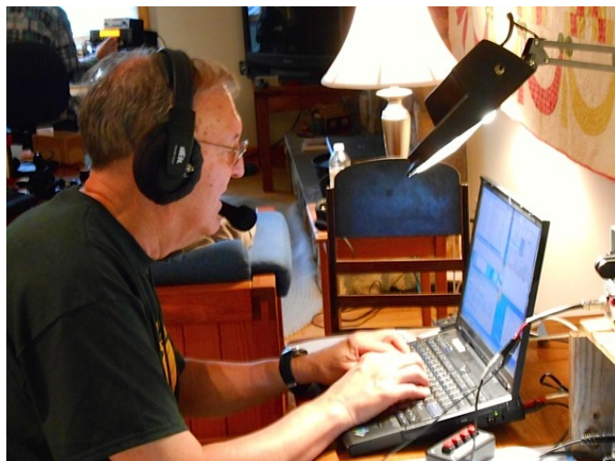
K8YC running hard on 40m SSB