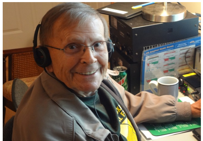
AA4NN seems happy that at least one of his shifts is almost over