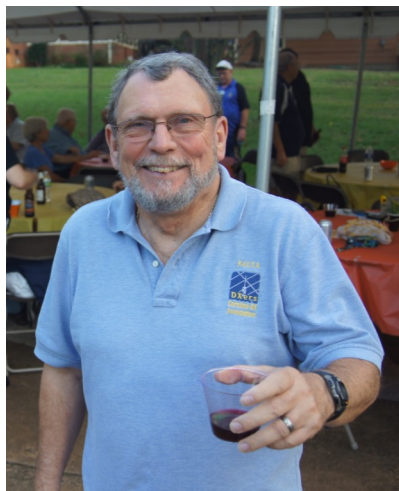
Thanks to you and Bev for being excellent hosts once again!