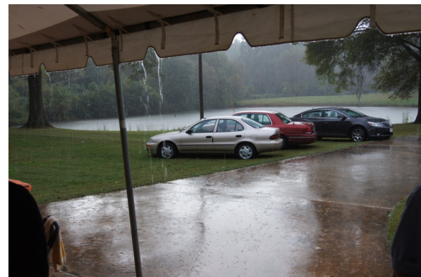
Was that lake there before it started raining??