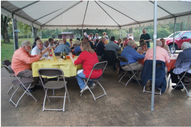
The rain stopped just in time for dinner to start!