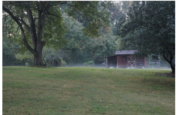
The Boyd's back yard after the deluge. Pretty place ya'll have there!