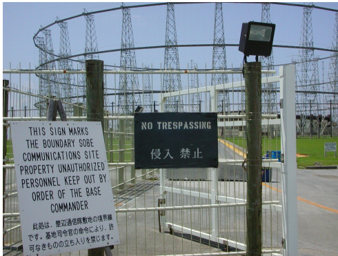
The entrance to the Sobe, Japan Wullenweber

Also in 1959, a contract to build a larger Wullenweber array, the AN/FLR-9 antenna receiving system, was awarded by the U.S. Air Force to GT&E Syl-