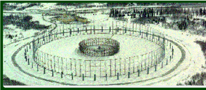
The Elmendorf AFB Wullenweber ...note the snow!

The picture of N4ZCs antenna farm in the February Pileup, and the article with details in last month's edition, got me thinking about big antenna farms. That got me thinking about the craziest looking antenna I've ever seen, and undoubtedly one of the most practical (at least for receiving): the Wullenweber. Check out the picture below to see what these big beasts looked like. All you need is several (...hundred) acres and a VERY understanding XYL ...and no HOA! You put your house/station in the center of the antenna array. Nothing to it. So what is a Wullenweber? I know that some of our members are military vets who were in communications or served at "listening posts." So, we probably have some members who do actually know what a Wullenweber is, how it works, and what it looks like. For the rest of you, here's what Wikipedia has to say, edited for at least a bit of briefness: