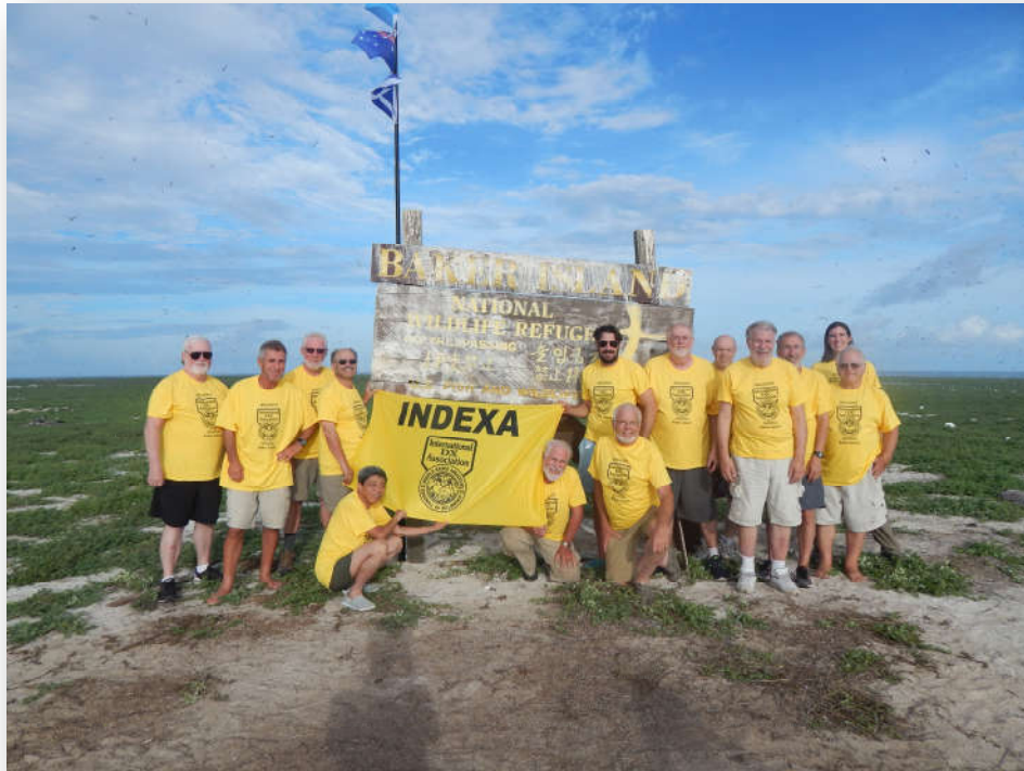
Here's the team that brought you KH1/KH7Z from Baker Island. This DXpedition was sponsored by the Carolina DX Foundation (CDXF).