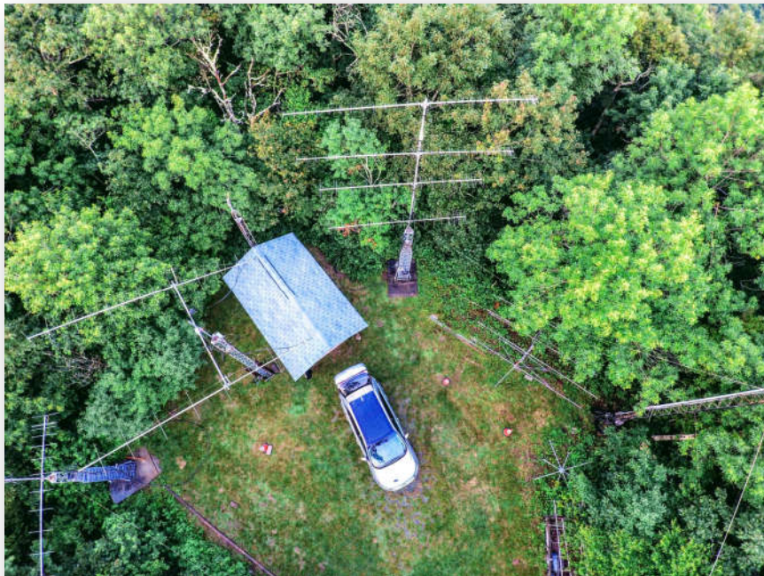
A bird's eye view of the AA4ZZ Contest Site used to activate W4VHF.